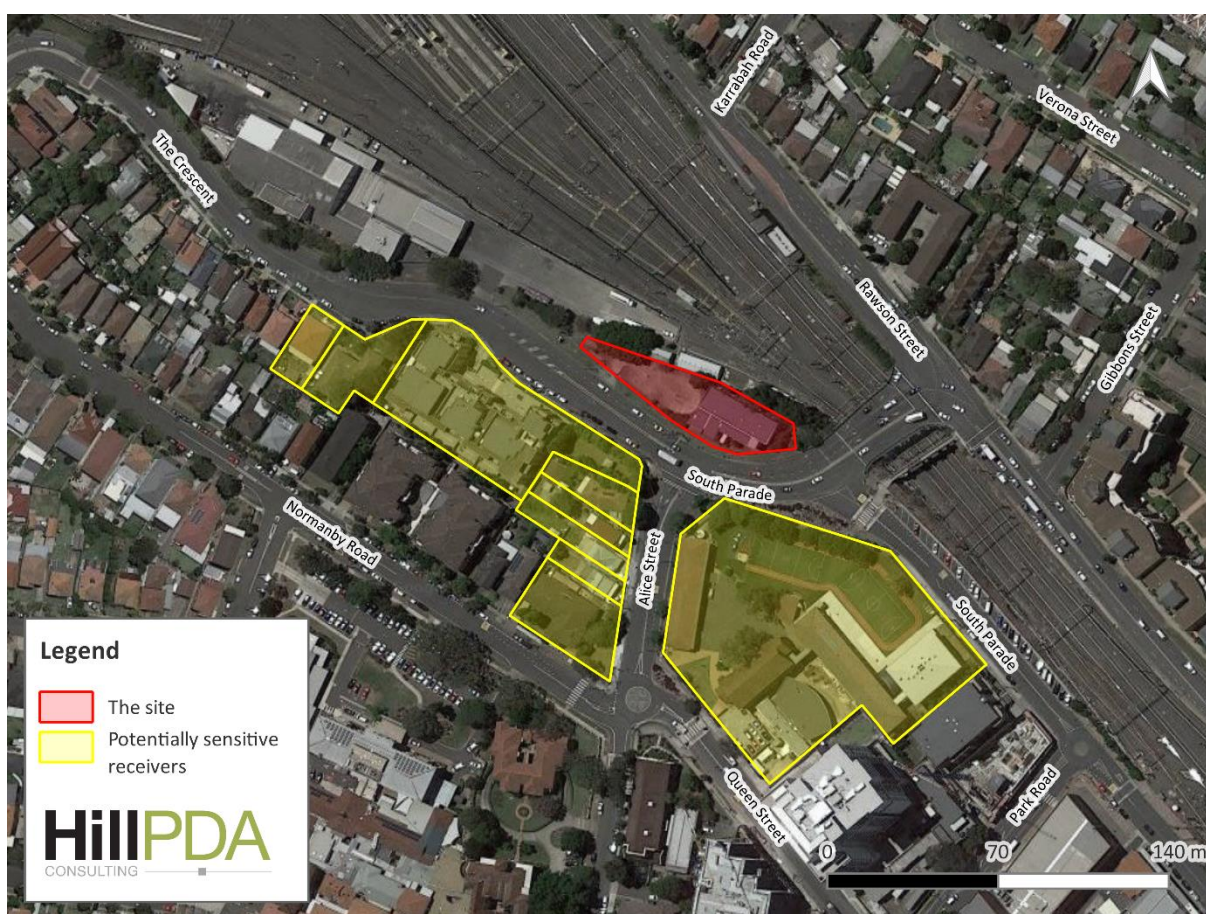
Figure 3: Potentially sensitive receivers near the site